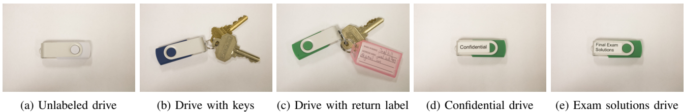
Fig. 1: Drive Appearances —We dropped five different types of drives. We chose two appearances (keys and return label) to motivate altruism and two appearances (confidential and exam solutions) to motivate self-interest, as well as an unlabeled control.