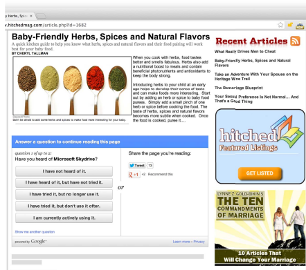
Figure 1. An example of how a respondent encounters GCS. They are asked to answer a short survey question, or share the page they are reading via social media in order to continue reading the publisher's content.